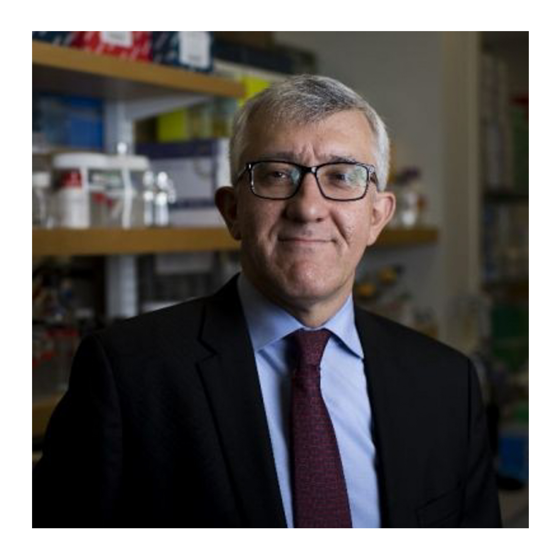
The Forsyth Institute Harvard School of Dental Medicine United States